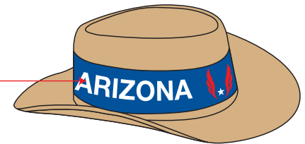
PETER GRIMM PG81 - STRAW HAT - KHAKI