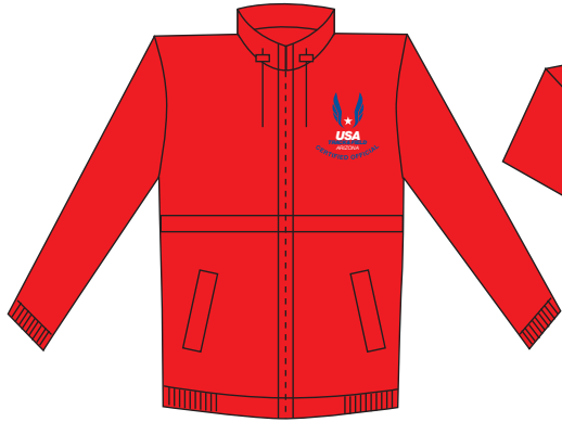
PORT AUTHORITY (OLD STYLE) J753 - CLASSIC POPLIN JACKET