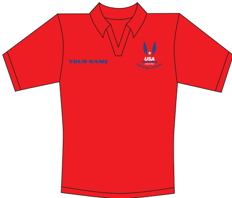
SPORT TECH L469 - LADIES DRI-MESH V-NECK SPORT SHIRT