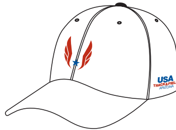
FLEXFIT® FROM GOLDEN STATE 6277 - COTTON BLEND