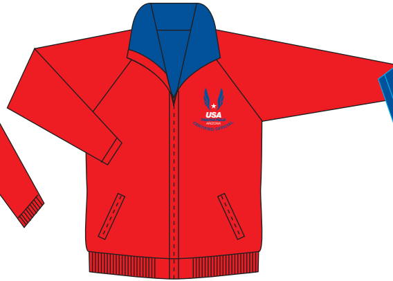
PORT AUTHORITY J754 - CHALLENGER JACKET