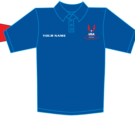
SPORT TECH K469 - MENS DRI-MESH SPORT SHIRT